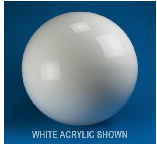
WHITE ACRYLIC SHOWN