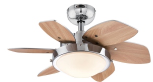
Reversible Beech Finish Blades