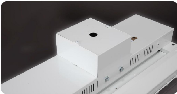
E2HBDH-PMK - Pendant mount kit