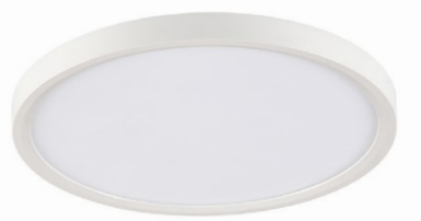
White Aluminum Housing & Frosted Plastic Lens