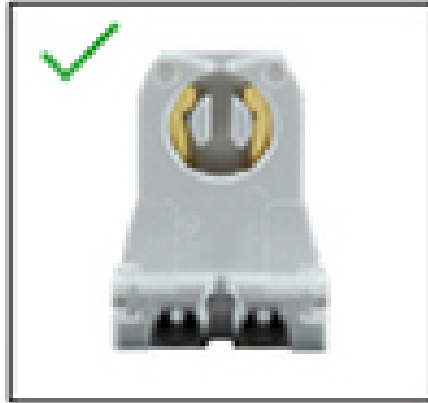
Non-Shunted(rapid Start Socket)