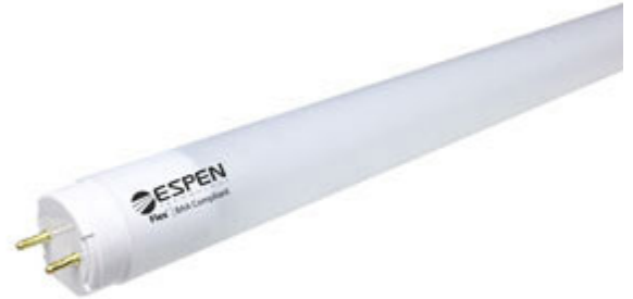
Internal Driver LED Lamp Double End Input