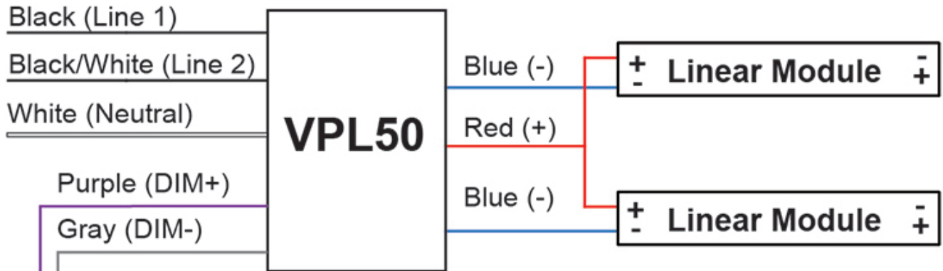
Output Current Selection