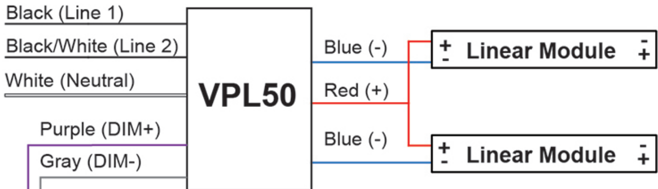
Output Current Selection