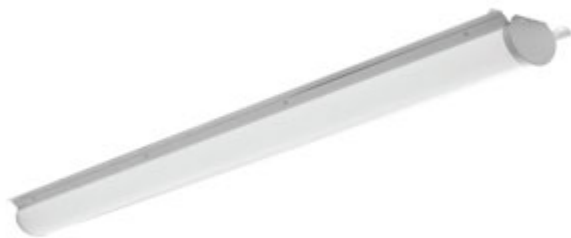
LED Versa Kit 8ft Channel

Commercial Grade LED Versa Kit 8ft Channel