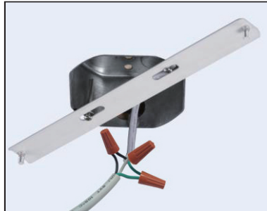
Step 2 1. Connect live supply wire (A) (typically black or the smooth, unmarked side of the two-conductor wires) to live fixture lead (B) with appropriately sized twist-on connector. 2. Connect neutral supply wire (C) (typically white or the ribbed, marked side of the two-conductor wires) to neutral fixture lead (D). 3. For positive grounding in a 3-wire electrical system, fasten the fixture ground (E) (typically cooper or green plastic coated) to the fixture mounting strap (1) with the ground screw (2).