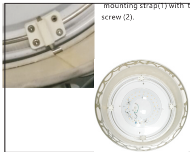
Step 4 Align decorative drum with locking ramps to fixture pins and twist until it locks into place.