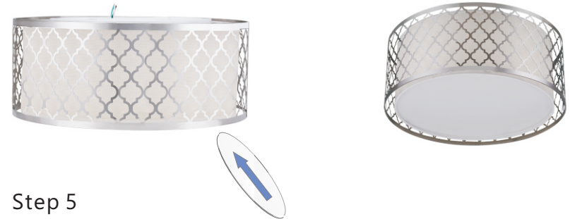
Step 5 Remove protective film on diffuser (provided). Tilt the diffuser and slide into drum. Gently rest it on bottom of drum.