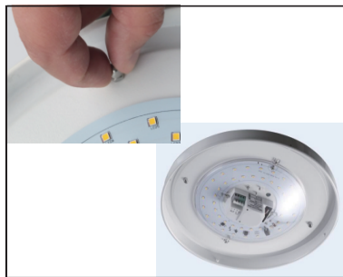
Step 3 Attach base of fixture to mounting bracket using two nuts (provided).