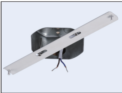
Step 1 Attach installation bracket to junction box using two screws (provided)