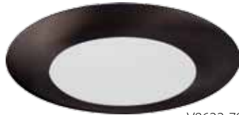
V8622-79 Antique Bronze