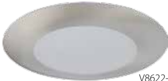
V8622-33 Brushed Nickel