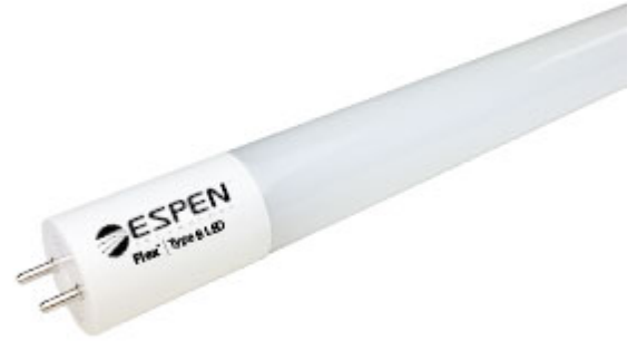
Commercial Grade LED T8 Lamp