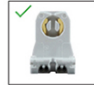
Non-Shunted (rapid Start Socket)

Note: Will not operate on shunted sockets. Use only with non-shunted (rapid start) sockets.