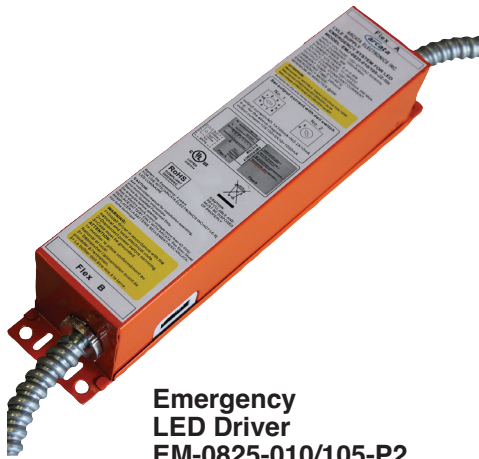
Emergency LED Driver EM-0825-010/105-P2